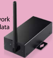
Box version is ready now!